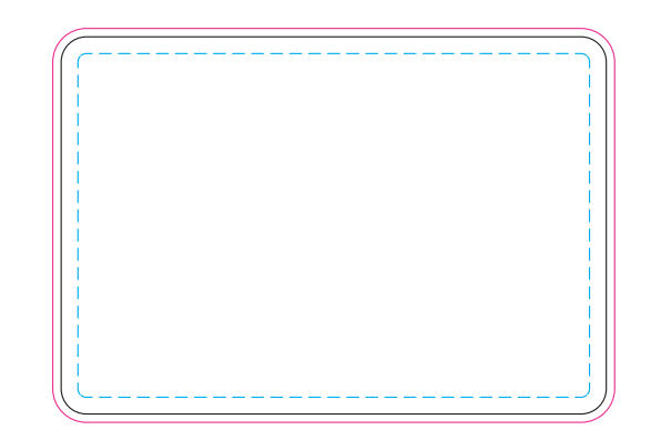
Blue Line = The SIGNIFICANT PRINT AREA (Keep all critical images & text within this box) Black Line = Maximum print area Pink Line = Bleed off to here